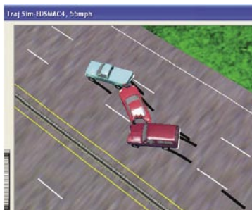
HVE simulation of three-car collision. Note that HVE shows full vehicle deformations resulting from impacts.